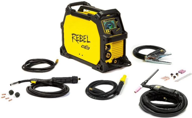
Rebel EMP 205ic AC/DC and accessories.

We made the impossible possible with the first-ever portable, all-process machine, complete with MIG, Flux-Cored, MMA, DC TIG, and now AC TIG capabilities, which means – yes – it TIG welds aluminium. It is a TRUE all-in-one welding system that delivers best-in-class performance in each process in the most portable, durable, go anywhere, weld anything industrial package on the market today.