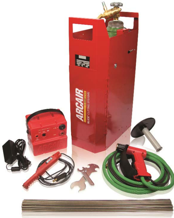
SLICE Complete Pack

Go anywhere and cut, burn, or pierce virtually any metallic, non-metallic or composite material with this exothermic cutting pack.